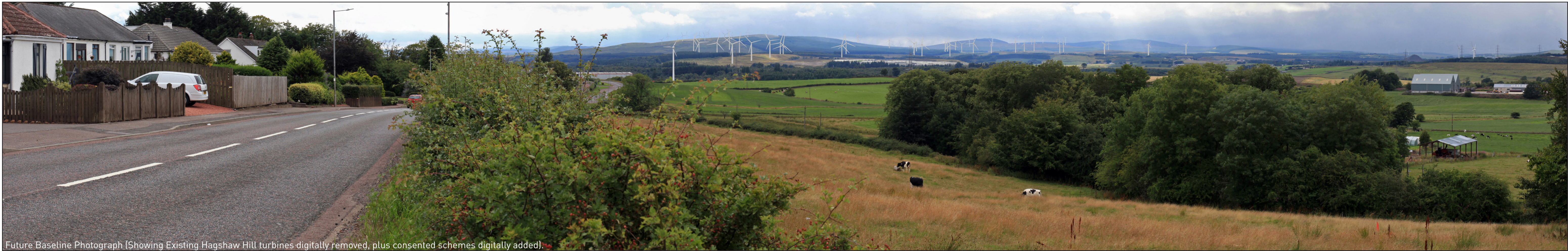
Future Baseline Photograph (Showing Existing Hagshaw Hill turbines digitally removed, plus consented schemes digitally added).