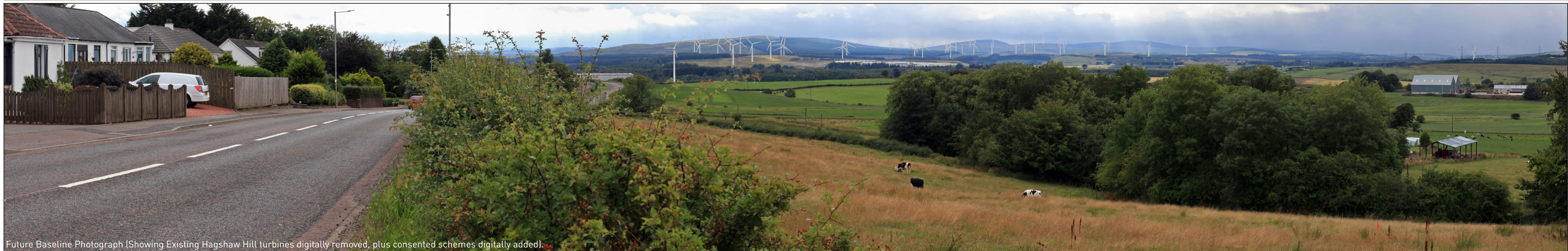
Future Baseline Photograph (Showing Existing Hagshaw Hill turbines digitally removed, plus consented schemes digitally added).