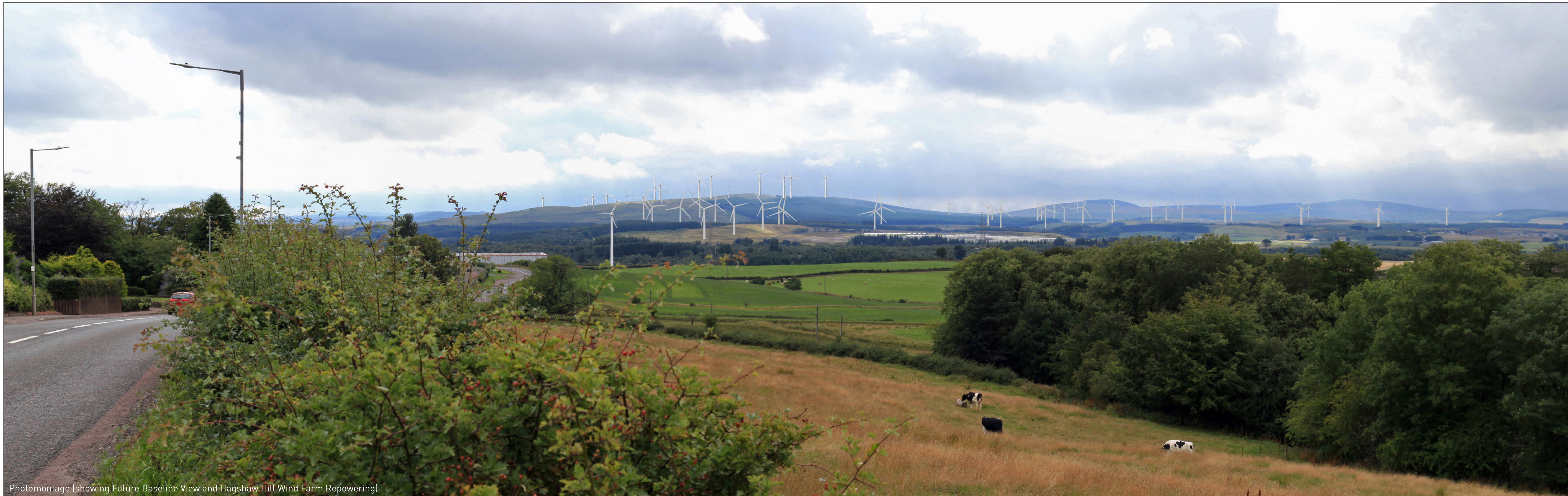
Photomontage (showing Future Baseline View and Hagshaw Hill Wind Farm Repowering)